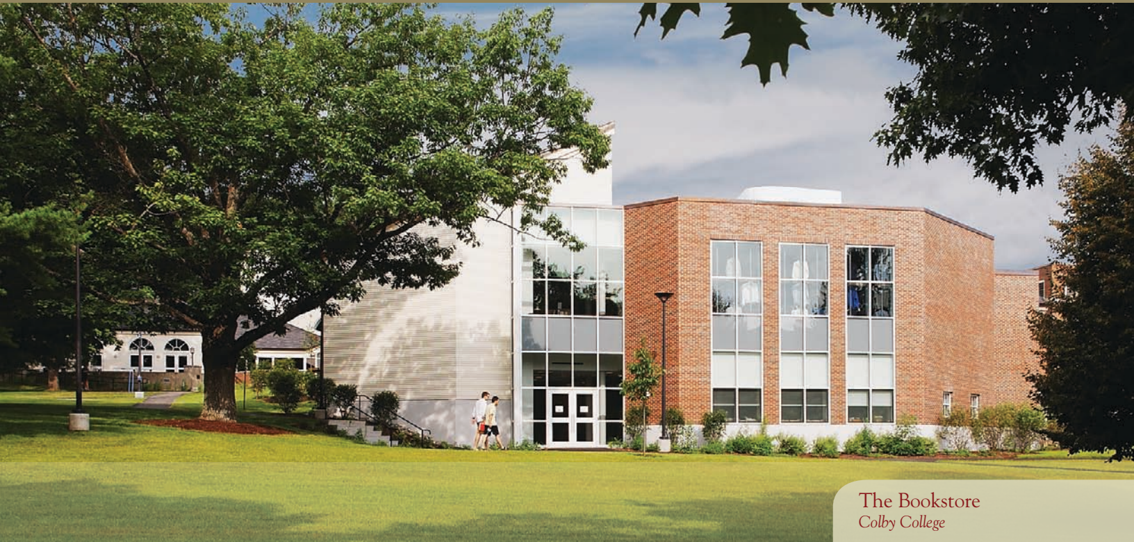
The Bookstore Colby College