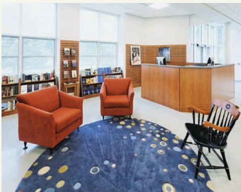
One of the reading areas inside Colby College's new bookstore.

"Knowledge is the light of the mind." The Colby College motto is inscribed on the wall as you enter the new 9,500-square-foot bookstore. The bookstore's completion in April, two months ahead of schedule, marked the end of the final phase of the Cotter Union renovation and expansion.